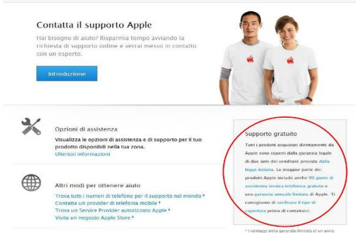
Page 3: AOS internet support page: http://www.apple.com/it/support/contact/

Apple added a reference to the vendor's legal guarantee, along with a link to the information page, to the AOS page entitled "Contact Apple Support".